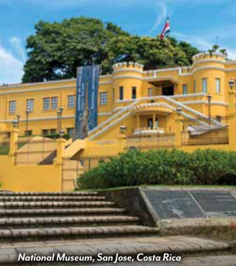
National Museum, San Jose, Costa Rica