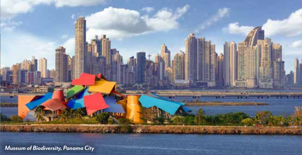
Museum of Biodiversity, Panama City