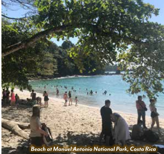
Beach at Manuel Antonio National Park, Costa Rica

Explore the island on a guided beach walk or a snorkeling adventure. (B,L,D)