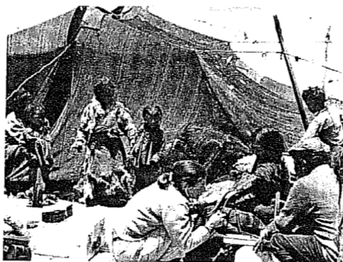
Prof. Beall measuring nomads in their camp at Bera at 16,300'.

Immediately following the signing of the agreement we left Lhasa for Tsatsey and during June and July, carried out preliminary research. We decided to focus on Phala Shang, a nomad group in Tsatsey Chu consisting of 55 families and 253 inhabitants, for a number of reasons. This group lives far north of Tibet's main east-west highway and is also relatively distant from the Chu headquarters at Tsatsey (three to five days' walk). Residing at altitudes of 16,000–17,800 feet, they are the highest natural population ever studied, an important factor since one of our goals is to study the adaptation of Tibet's nomads to the stress of high altitude hypoxia. They have also maintained their traditional lifestyle. Living in small encampments of one to four families, they manage their herds using traditional pastoral technology and strategies. They still live in tents, hunt with matchlock rifles, collect salt from distant salt lakes, and obtain their grain foods by trading animal products and salt with farmers living 20 days to the southeast. Their beautiful but harsh environment—it snowed several times, and in mid-summer the temperature frequently dropped below