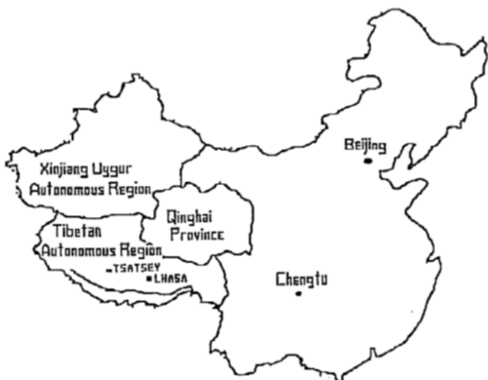
Tibetan Autonomous Region and nomad research site.