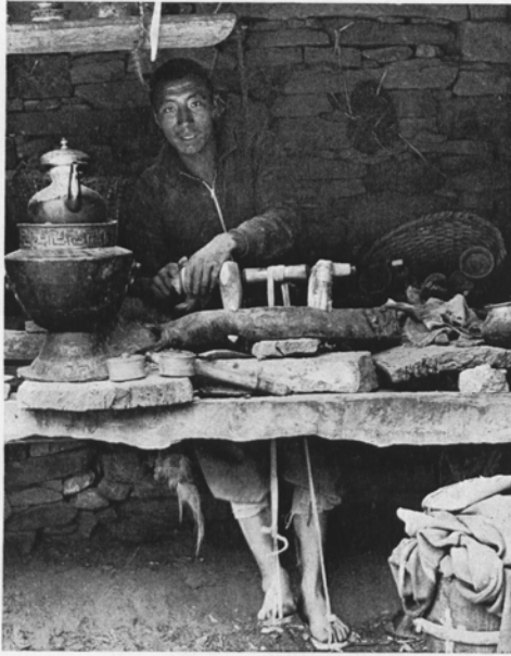
FIG. 37. — Foot-operated traditional lathe used for finishing wooden bowls. The bowls are initially shaped in India on water driven lathes and then brought to Limi to finish in summer. In Limi the bowls are glued on the ends of the horizontal bar which is moved back and forth by the feet and sanded with various grades of locally made « sandpaper ». The sandpaper is made from strips of leather on which sand of different degrees of coarseness has been glued.