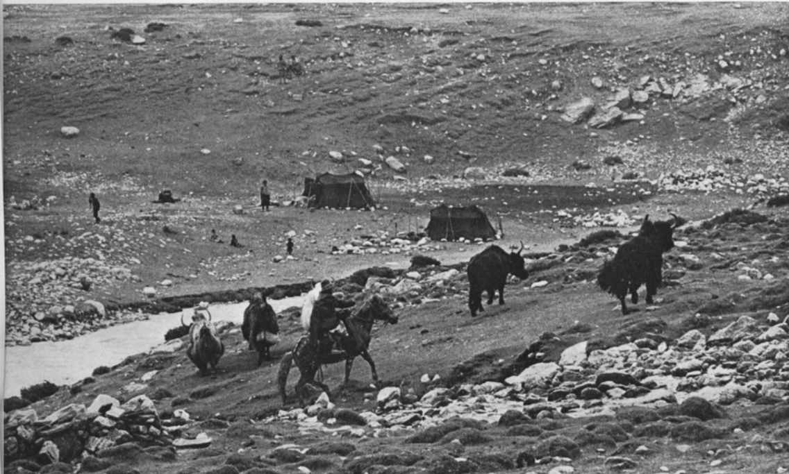
FIG. 34. — Herding yak on horseback in Dragtse (4 115 m) just East of Tsang. The horses in Limi are standard Tibetan horses which are either bred locally or bought from Tibet. A good horse costs from 2 500-4 500 rupees.

The maintenance of herds of sheep and yak is very lucrative. These animals are not only usable for carrying salt from Tibet to Limi and from Limi to the Humla Karnali ecozone in the South but also for wool, meat and milk products. In 1974 the price for wool in Limi was six to nine units, pbre , of grain per sheep's wool, the range in price depending on the size and quality of the wool. Taking seven as an average price, a person with 170 sheep would obtain grain equal to about one-half an acre. This, as will be remembered, is more than what the mirey level families normally have in land. Another example of the large profits associated with animals can be seen from a 1973 example. In this case a family with a herd of about 350 sheep took 150 of the males and old females to Jumla to sell and got an average price of 150 per animal or a total of 15 000 rupees. The