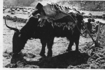
FIGS 35 et 36. — Left, Tsang fields with piles of composted human and animal manure. Dzo-pa , male cross between a bull and female yak, with plowing set up in early May. In Limi the first plowing is done by a single dzo and the second by a single horse. Above, dzo hybrid with plowing set up. Early May.

family still had over 100 mamo (adult female sheep) so that in a few years' time it could easily rebuild the herd to its original size.