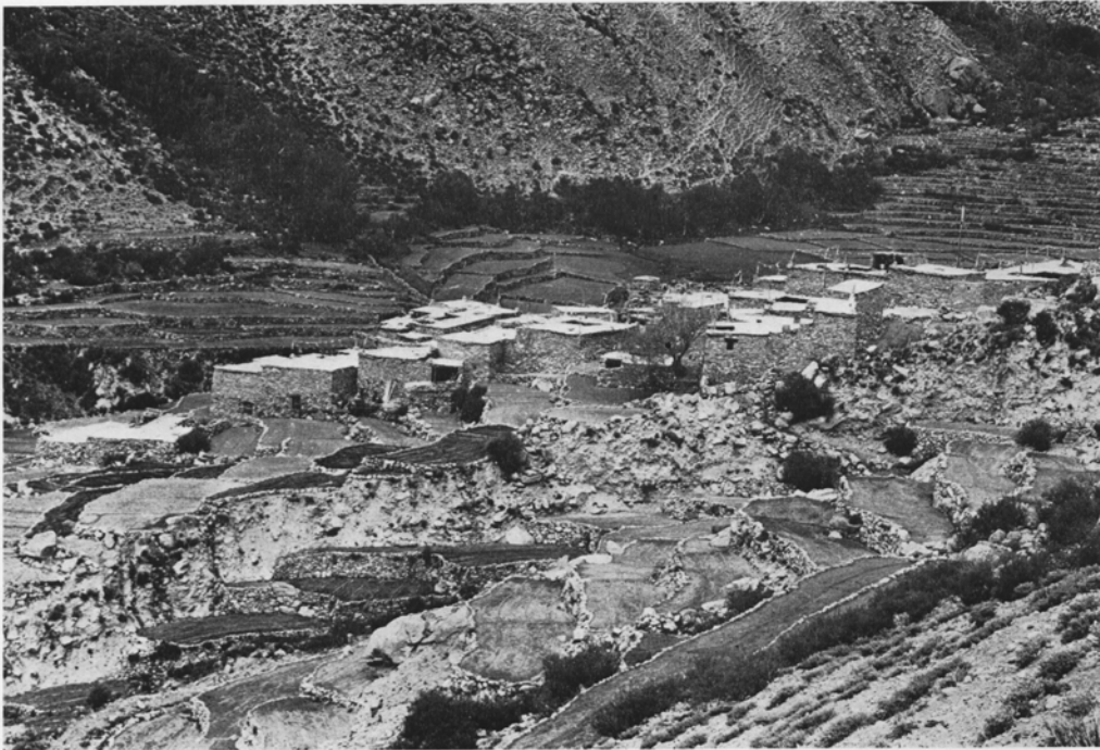
FIG. 33. — Til village, early June.

Geographically, then, while Limi is totally cut off from the rest of Nepal for the winter, free access to the Tibetan region of China exists throughout the year. This situation in a sense symbolizes Limi's traditional binational orientation. Completely Tibetan in language and culture, Limi for centuries (going back at least to the era of the Jumla Malla kings) has had political ties with Nepal.