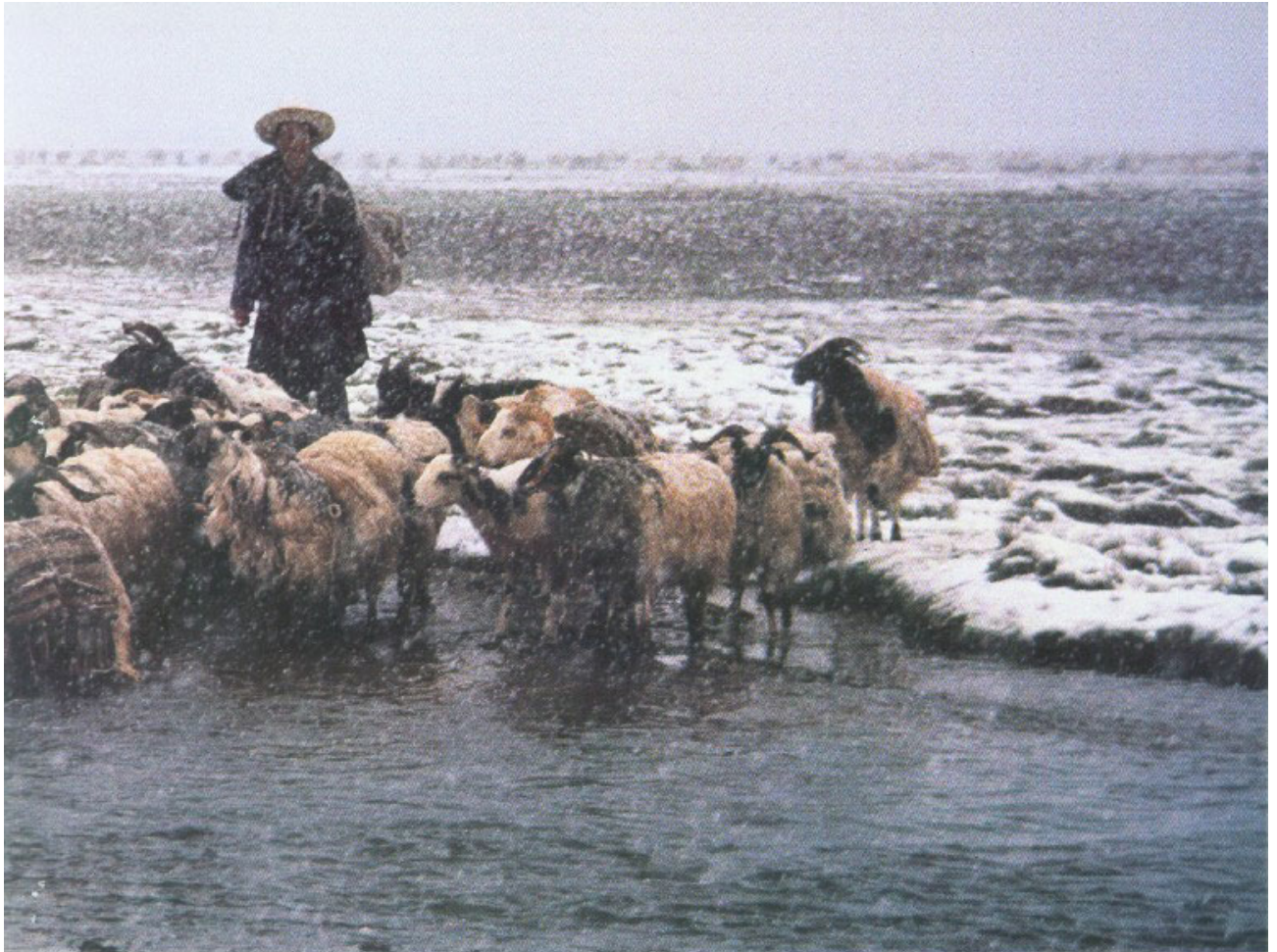
Figure 1. Adult sheep and goats are often used to transport items such as grains and salt. Each animal carries 7.5 to 11.5 kg in a pair of locally woven, woolen saddlebags.

ous Region. It is located in the western section of the Northern Plateau, at the boundary of what Chinese refer to as the Northern Tibetan Plateau Subregion and the Ngari Plateau Subregion of the Qinghai-Tibetan Plateau (Ren et al. 1985). Located ~480 km northwest of Lhasa and 185 km north of the main east-west road, it is situated at altitudes ranging from