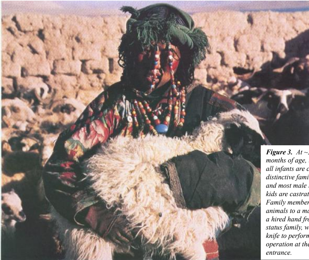
Figure 3. At ~3 to 4 months of age, the ears of all infants are cut with a distinctive family brand, and most male lambs and kids are castrated. Family members carry animals to a man, usually a hired hand from a low status family, who uses a knife to perform the operation at the corral entrance.

91 goats (based on a conversion rate of one yak to six sheep or seven goats) in the 1940s and 1950s. Thus, access to a pasture with a one-marke rating would be allotted to a household with some combination of animals totaling 13 yaks, 78 sheep, or 91 goats. A pasture of two marke would be allotted to a household with twice that number. Each pasture was expected to sustain only what was considered an appropriate number of livestock. How these stocking ratios were originally constructed is not clear, but they were not frequently adjusted.