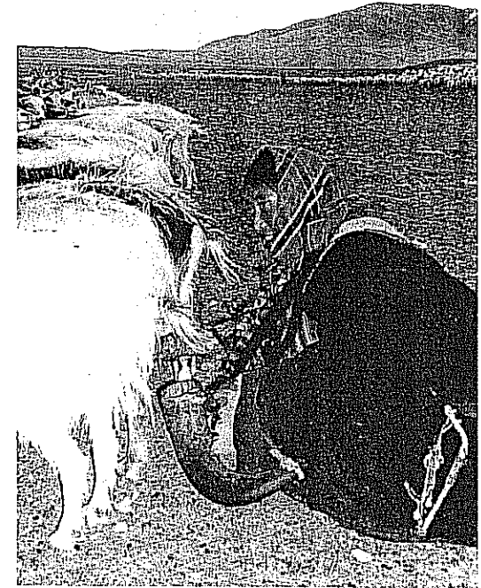
Photo 11.1 Wild yak horn used as a milking pail in northern Gertse

wealth or access to such items. However, many hunters still also use various traditional technologies (described in Huber 2005), often in combination with modern methods. Homemade muzzle-loading matchlock guns (and much more rarely, simple breech-loading rifles) have been in widespread use (Photo 11.2). An ancient style of leghold trap called khogtse 2 is still made from braided grass and animal hair with spikes of antelope horn (Photo 11.3). 3 The use of a combination of firearms and khogtse traps (and bows and arrows) for hunting in the region was first recorded in 1874 (Trotter 1915:165). A large-scale 'road trap' or type of game drive structure locally known as dzaekha 4 are also set up to catch migrating Tibetan antelope ( Panthalops hodgsoni ), although their use has recently died out due to official restrictions upon antelope hunting. Hunters also construct simple blinds or hides by digging shallow pits and erecting low stone walls within or behind which to lay in wait for animals with loaded firearms, whilst food bates are sometimes employed to attract particular species during winter. Dogs are almost always used to hunt species of wild sheep in rocky areas.