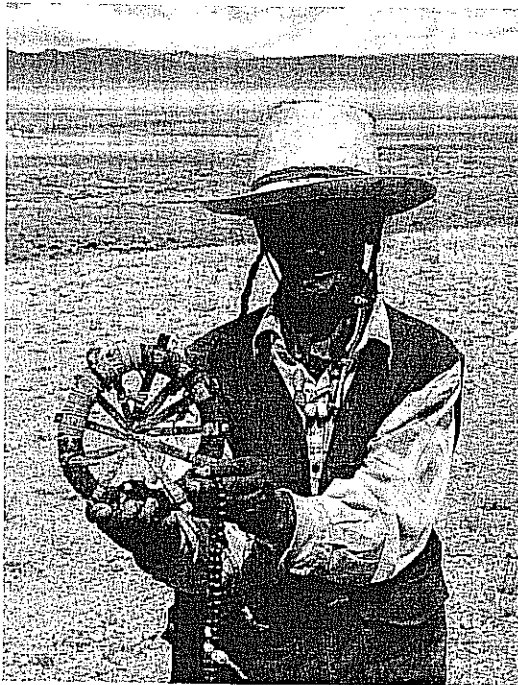
Photo 11.3 Retired hunter with a khogtse leghold trap in northern Gertse