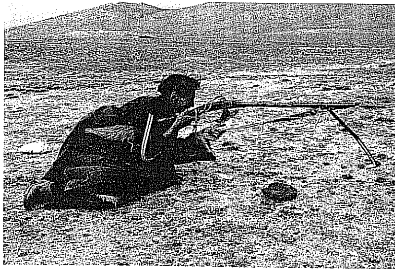
Photo 11.2 Hunting with a matchlock gun in northern Gertse