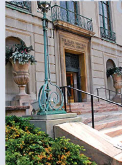
Allen Memorial Medical Library

Premier Industrial Corporation Prevent Cancer Foundation PricewaterhouseCoopers LLP The Progressive Corporation J. Ambrose Purcell Trust Puritan-Bennett Foundation R.T. Foundation Ranney Foundation Christopher and Dana Reeve Foundation Reference Metals Company, Inc. Research Corporation for Science Advancement The Retirement Research Foundation Robert R. Rhodes Testamentary Trust Richman Family Foundation Fannie E. Rippel Foundation Roche Rockwell Automation, Inc. William G. Rogers Trust Rosskamm Charitable Lead Annuity Trust Rottman Family Charitable Foundation Roulston Family Fund Roush Foundation RPM International Inc. Fran and Warren Rupp Foundation S.C. Johnson & Son, Inc. Russell Sage Foundation