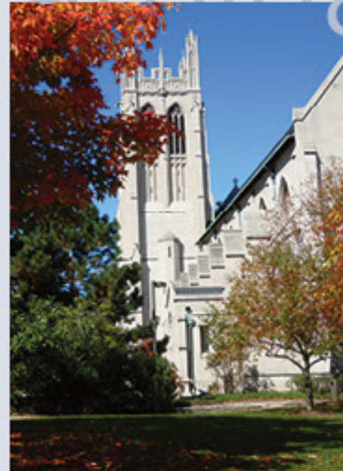
Amasa Stone Chapel