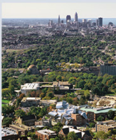
Case Western Reserve campus— a unique urban experience