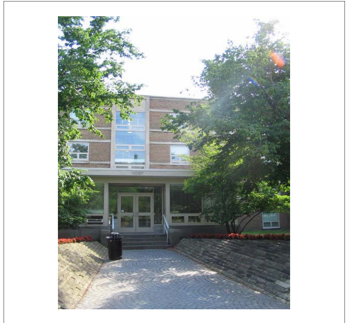
Yost Hall from the Quad

Yost Hall, located on the Case Quad between Wickenden and Tomlinson, was built as a dormitory in 1950. Now it houses a number of departments and administrative offices, like Math, Statistics, University Registrar, Office of Student Employment, Housing and Residence Life, and Greek Life. One can see a number of mysterious doors in the walls which have long since been sealed off with bricks and painted over. These doors are a result of the conversion of the building from a dormitory. The reader would be wise to note that this would be an excellent location for a residence hall, as the building is at an advantageous location on the Case Quad. Why it was changed remains is a great mystery to many.