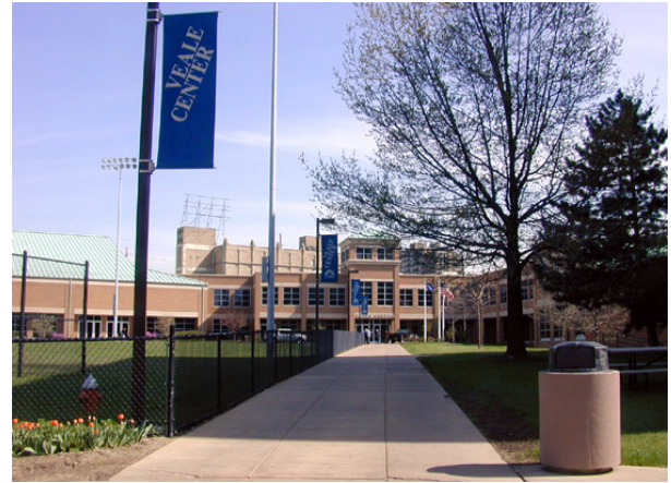
Veale Convocation Center from the Quad

The Veale Convocation, Athletic and Recreation Center is the home of Case Athletics, Physical Education and Intramural programs. The Veale Center houses four multi-purpose courts (which are frequently used for activities such as basketball, tennis, soccer and volleyball), a six lane indoor track (8 x 1/2 mile) and a multipurpose aerobics room. A cardio exercise room, (with treadmills, elliptical trainers, stair-step machines, rowing machines, a gravitron and stationary bikes), a newly renovated weight room, (three separate rooms, Main, Power Lift and Hammer Strength), nine racquetball courts, two squash courts and the new rock climbing wall, Horsburgh gym (used for basketball and volleyball), Veale Natatorium and Donnell Pool complete the facility. Veale along with Van Horn Field, (which is located directly outside of Veale), Adelbert gym, (adjacent to Van Horn) and Freiburger Field, (corner of East Blvd. and Bellflower), are used for athletics.