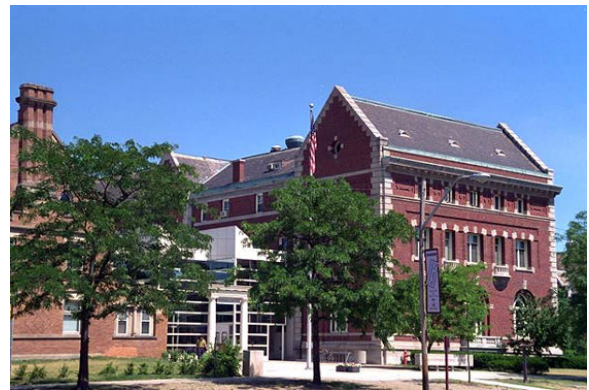
Thwing Center from Euclid

The Undergraduate Student Government sponsors all groups and eases the forming of new student groups. University Program Board brings concerts to campus and takes trips off campus.