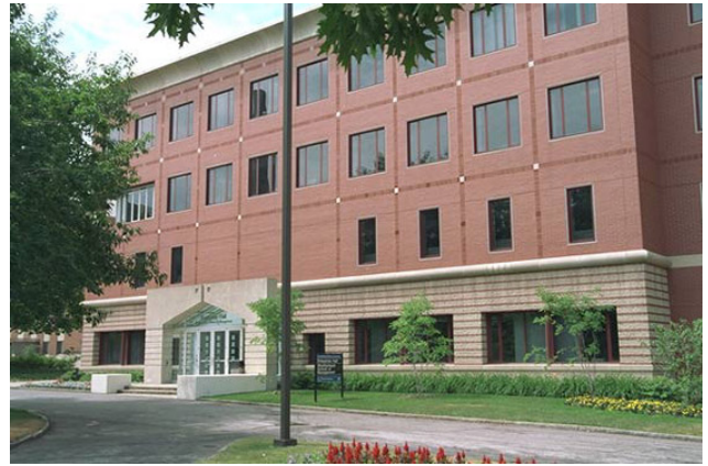
Nord Hall from the Quad

Built in 1988, Nord Hall (formerly Enterprise Hall) is home to the dean's offices of the Case School of Engineering and the School of Graduate Studies, The Institute for the Integration of Management and Engineering (TIIME), and the University's Corporate and Government Relations departments. It features a spacious rotunda, Einstein Brothers' Bagels and the School of Engineering Computer Lab.