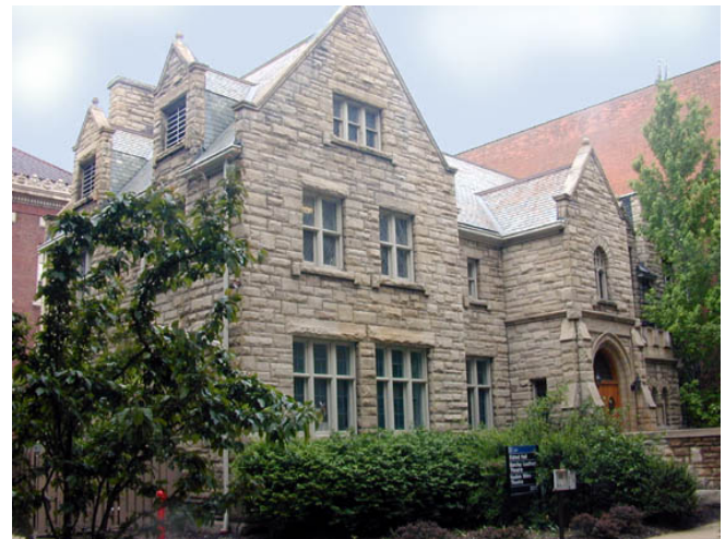
Eldred Hall from Quad