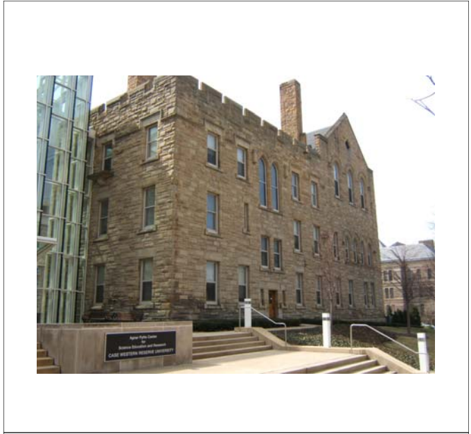
DeGrace Hall from Adelbert Road