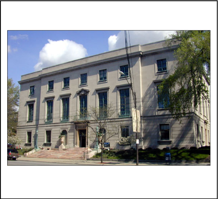
Allen Memorial Medical Library