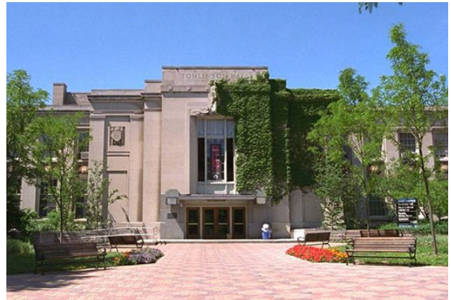
Tomlinson Hall from the Quad

Built in 1947, Tomlinson contains the Office of Undergraduate Admission, a cafeteria, and the main office of the Student dining service. The cafeteria, which contains a Subway is located in the basement which is accessible down the stairs on the left of the entrance. The building is also connected to Crawford through a hallway in the basement on the opposite side of the cafeteria.