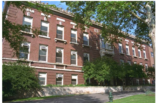
Rockefeller from the Quad