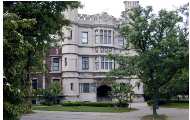
Mather Memorial from Mayfield