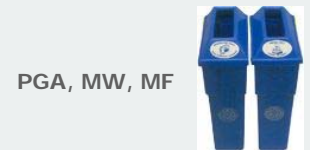
PGA, MW, MF