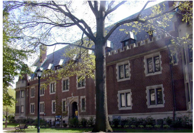
Mather House from Mather Quad