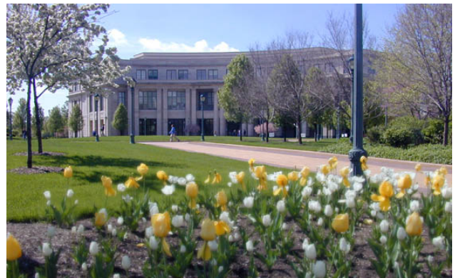
KSL from Euclid

Kelvin Smith Library is the main library and opened in 1996. With 150,000 square feet, moveable shelves holding 1.2 million volumes and state-of-the-art technology, the building provides ample space and access to resources. Every study carrel is networked for laptop users. The Education Support Services office is located here and provides tutoring and academic support for all students. Students also have access to EuclidPLUS and the Case network from computer terminals located throughout the library.