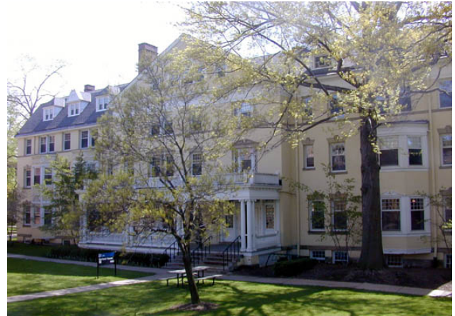
Guilford House from Mather Quad

Built in 1892 originally as a dormitory for women attending Flora Stone Mather School for Women, Guilford houses the departments of English, Modern Languages and Literature, and Women's Studies. Included in Modern Languages are Chinese, French, German, Italian, Japanese, Russian, and Spanish. There is also a computer writing lab on the first floor.