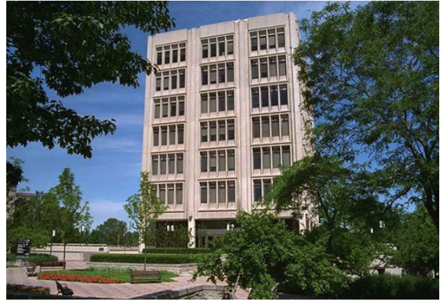
Crawford Hall from the Quad

Built in 1969, Crawford houses Human Resources and a number of departments within Information Technology Resources. The central computer that drives the campus-wide fiber-optic network is located here, as is a model of the apparatus used in the Michelson-Morley experiment.