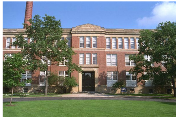
Bingham from the Quad

Built in 1927, Bingham houses the Civil Engineering department and its laboratories, including the Soils Lab, the Concrete Lab, and the machine shop. Bingham also houses a "clean room" for microchip production, an electronics design center which specializes in pressure gauges and bionic devices, and a laser lab.