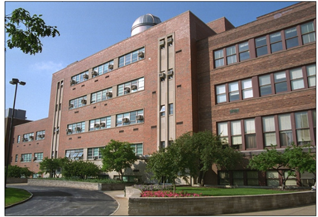
AW Smith from Quad

Built in 1939, A. W. Smith houses the Geology, Chemical Engineering, and Astronomy Departments. A. W. Smith also contains the campus' main computer lab and an observatory available for student use.