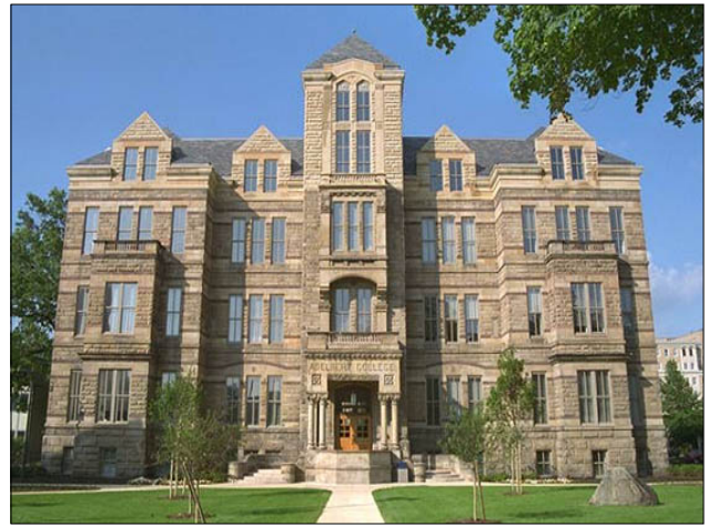
Adelbert Hall from Quad