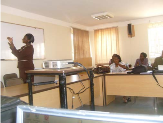
Florence during the mini conference held by SABRES