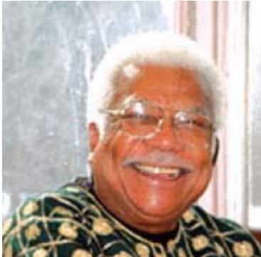
Prof. Ali A. Mazrui

Makerere University (Mak) will honour and recognize in perpetuity Professor Ali A. Mazrui, Africa's illustrious scholar, globally recognised as "one of the world's top 100 public intellectuals". He is one of Makerere's most renowned former Professors and Deans who credits Makerere for being the cradle of his global scholarship and fame. This was conceived by Makerere University Private Sector Forum (MUPSF) a new initiative established to bridge the linkage between the University and the Private Sector in fostering competitiveness in the value chain.