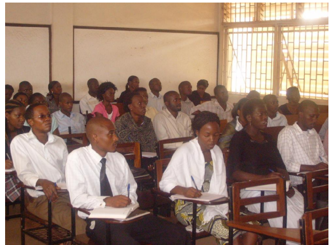
participants during one of the sessions

On the first day, the participants were taken through hypotheses and overview of research design; while integrating qualitative and quantitative data in research design was done on the second day.