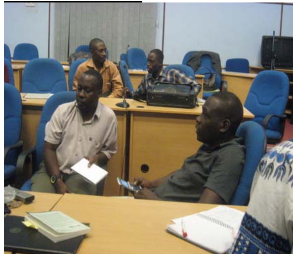
Fellows attending a webcam session at UMI on 10 th October 2008