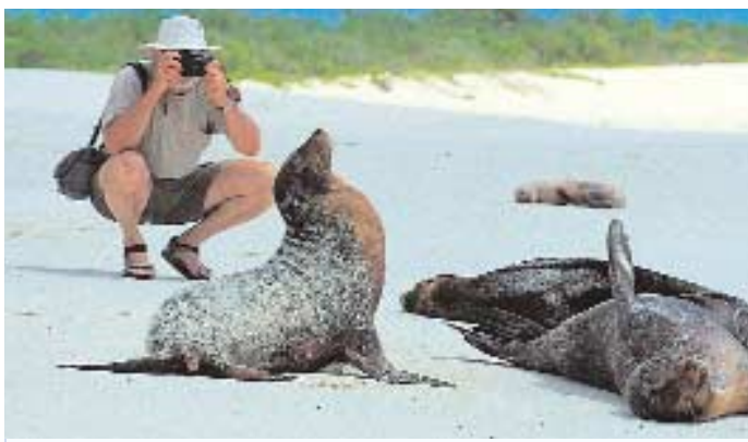
Take the photographs of a lifetime in the Galápagos, where wildlife allows humans to approach it up-close, unlike anywhere else on earth.