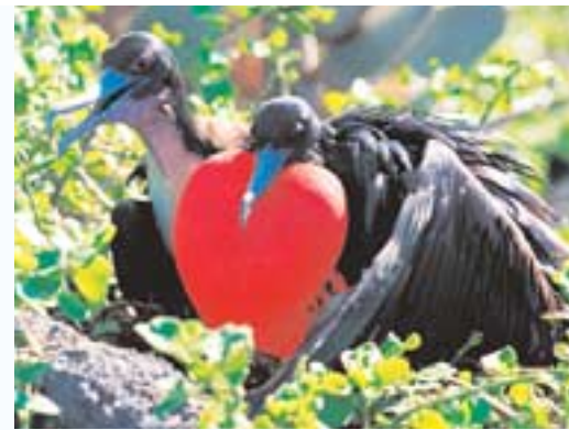
A magnificent frigate puffs up his chest—an act intended to impress his mate.