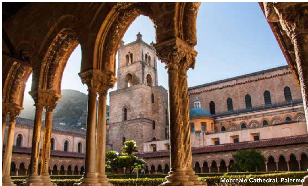
Monreale Cathedral, Palermo