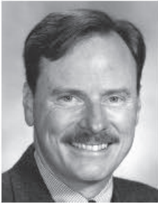
FROM THE DITTRICK MEDICAL HISTORY CENTER