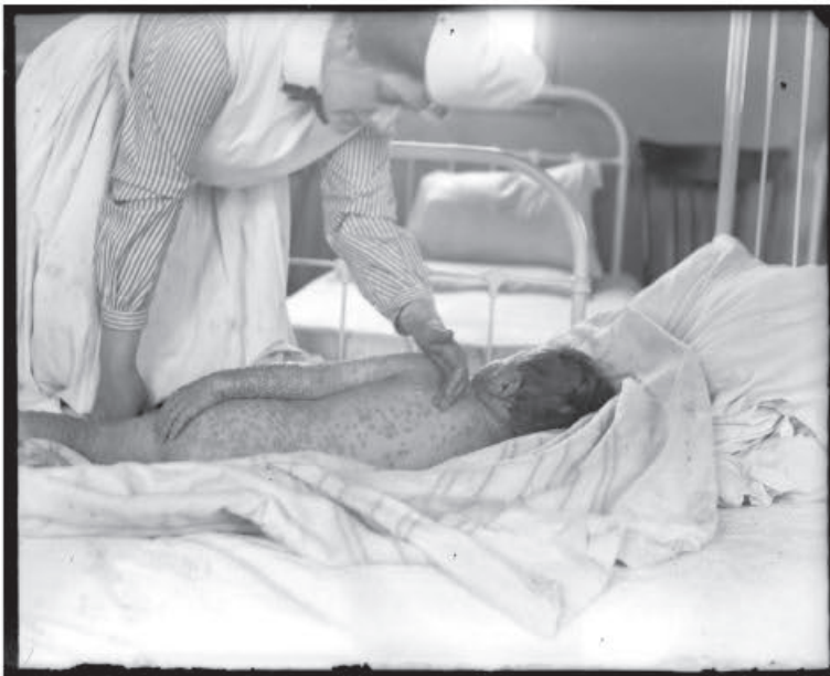
Smallpox patient with nurse from the Hartzell collection.