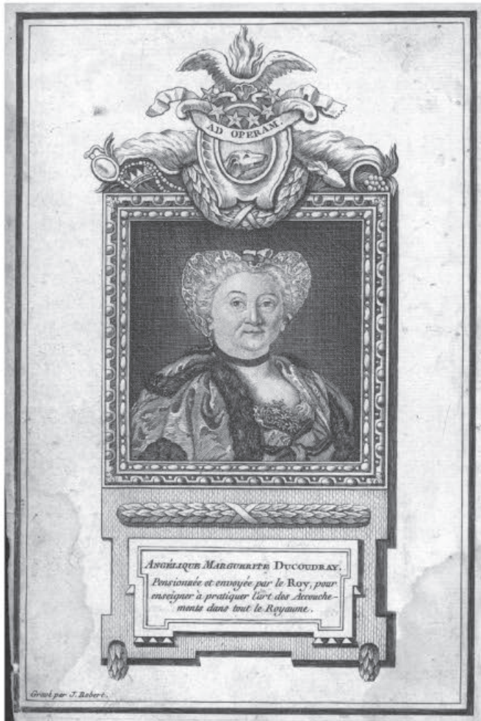
Angélique Marguerite Le Boursier du Coudray. Abrégé de l'art des accouchemens, dans lequel on donne les préceptes nécessaires pour le mettre heureusement en pratique . . . (1769).